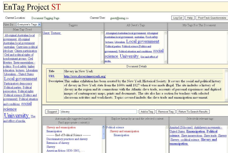
Figure 2. Tagging interface: Enhanced Tagger

What follows is an example of how a tag is chosen from suggestions in the Enhanced Tagger (see Figure 2). After searching for the term 'slavery' in all fields, a list of resources is returned. The resource chosen is 'Slavery in New York', an online exhibition on history of slavery in New York State ( http://www.slaveryinnewyork.org/ ). By clicking on the "Tag" button, the enhanced tagging interface opens. In the text box in the middle of the screen the tag 'slavery' is entered and the Suggest button clicked, to get DDC-based suggestions. The first bottom pane displays 19 matching classes. The top two of these belong to political science. The End of Political Science line means that the classes below it belong to different subject areas which could be related to politics. Mousing over each caption will display its immediate superordinate class. The top found classes are the following ( the superordinate class in parentheses ):