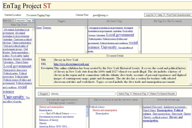
Figure 2. Tagging interface: Enhanced Tagger

What follows is an example of how a tag is chosen from suggestions in the Enhanced Tagger (see Figure 2). After searching for the term 'slavery' in all fields, a list of resources is returned. The resource chosen is 'Slavery in New York', an online exhibition on history of slavery in New York State ( http://www.slaveryinnewyork.org/ ). By clicking on the "Tag" button, the enhanced tagging interface opens. In the text box in the middle of the screen the tag 'slavery' is entered and the Suggest button clicked, to get DDC-based suggestions. The first bottom pane displays 19 matching classes. The top two of these belong to political science. The End of Political Science line means that the classes below it belong to different subject areas which could be related to politics. Mousing over each caption will display its immediate superordinate class. The top found classes are the following ( the superordinate class in parentheses ):